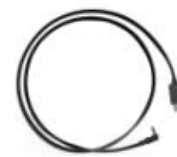
Programming Cable (USB Port) PC45